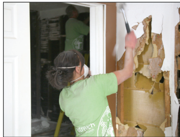
Dathouse Community Center