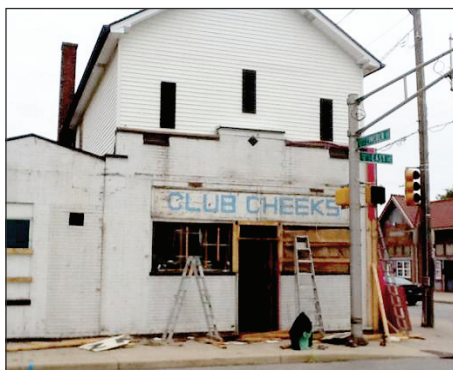
Former Sassy Kats show club at Lincoln and East Streets. Pink façade was recently removed only to discover remnants of former show club.

Dathouse and its programs have always been run from one or more of our homes. We felt strong about starting a community center and having a place that would be a better home for our organization. To that end, we acquired the former Sassy Kats show club (thanks to those who helped shut it down) in February of this year and are currently in the remodeling process. We have many ideas for uses of the building. We will definitely use it for our youth hang-out times. We would like to have family fun nights and movie showings as well. We have a passion for early education and preschool-age kids learning opportunities. We are not sure of all the things we will initiate, but we want to offer the building to be used by others who want to initiate their ideas.