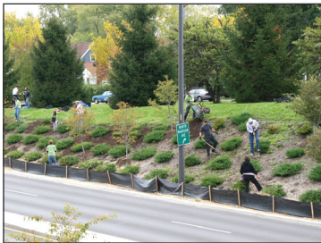
Morris/Prospect Corridor Maintenance

Due to the drought over the summer, many of the plants and trees along the Morris/Prospect Corridor and New Jersey Street Esplanade did not survive. These plants/trees were replaced and new mulch was installed. A vacant lot at the corner of Alabama and Lincoln Streets was transformed into a garden for IPS School 31, complete with planting beds, a picket fence, and a trellis. Major progress was made on the interior remodeling of the former Sassy Kats showclub into a community center. Two lots were cleaned up at Singleton and Beecher in preparation of installing a park. A new landscaped pocket park area was installed around the 600 Block of Prospect (on the north side). Finally, trash was cleaned up from streets and alleys. In total, six 40-cubic-yard roll-off dumpsters were completely filled. If you haven't had a chance to check out these projects, please take time to drive by and appreciate them. See photos on the Bates-Hendricks Neighborhood Association Facebook page: facebook.com/bateshendricks