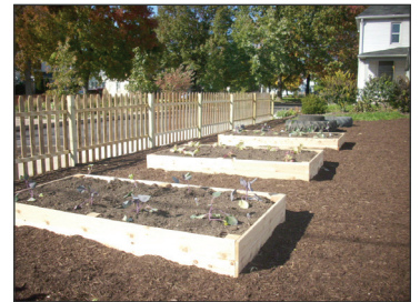
School 31 Community Garden