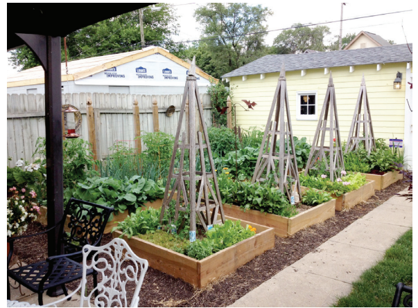
Greg Allen's Garden

On July 5 from 6:00pm to 9:00pm, the Harrison Center is hosting FoodCon, an unconventional convention and one-of-a-kind showcase and exploration of the art and culture of food in Indianapolis. The event attracts over 2,000 attendees. Greg Allen from Bates-Hendricks will host a table on using worms to compost our food scraps.