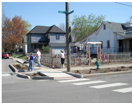
School 31 Garden Maintenance