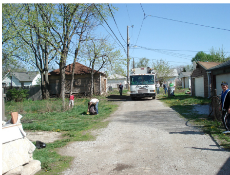
Street & Alley Trash Pickup