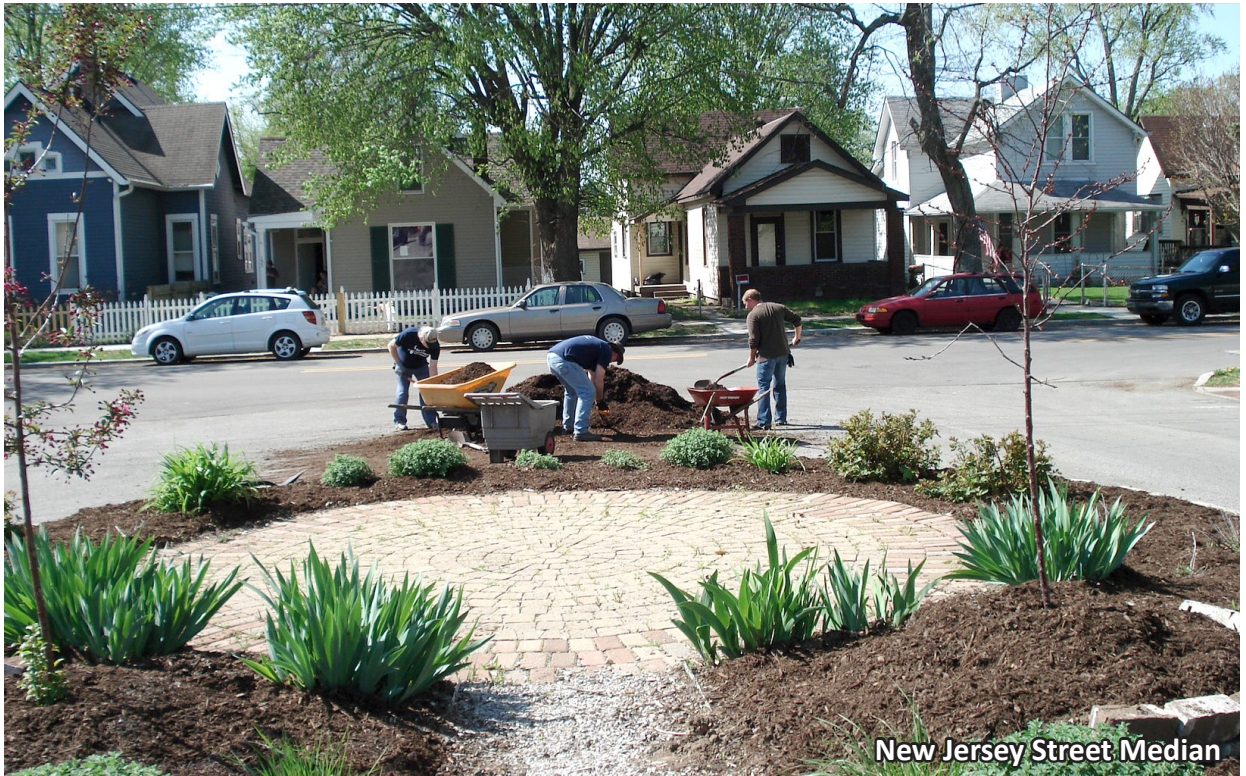
New Jersey Street Median

The morning of Saturday, April 26 came with a buzz of energy as more than 350 volunteers spread out across our great neighborhood! Teams of 10-15 volunteers cleaned litter and trash from every street and alleyway, cleared invasive plants from the Pleasant Run Creek and the Morris/Prospect greenscapes, planted trees, and built fences! In all, over 1,500 work hours went into the Bates-Hendricks Great Indy Cleanup this Spring! To accomplish this task, we had some amazing help from Northview Church in Carmel, Keep Indianapolis Beautiful, and the City. After everyone was finished with their section, volunteers gathered at the newly-created Baumann Park for hot dogs and refreshments, thanks to a donation by Fountain Square Brewery.