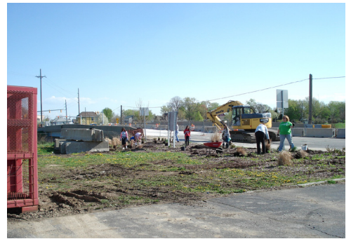
Immanuel Church Landscaping & Painting