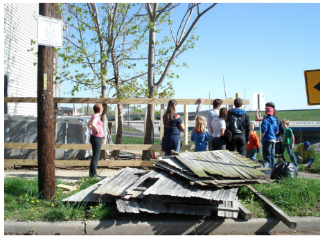
Wright Street Path Fence & Landscaping