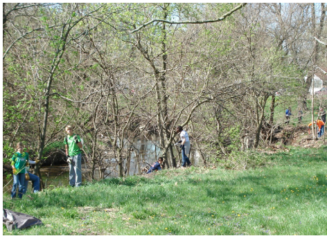
Pleasant Run Creek Invasives Removal

More photos are available on the Bates-Hendricks Facebook page at www.facebook.com/bateshendricks