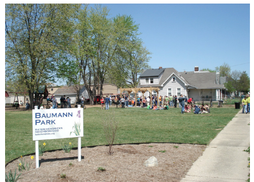
Post-Cleanup Celebration in Baumann Park