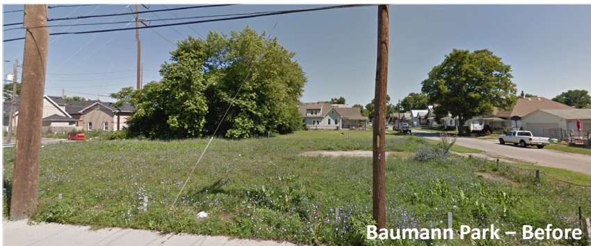
Baumann Park – Before