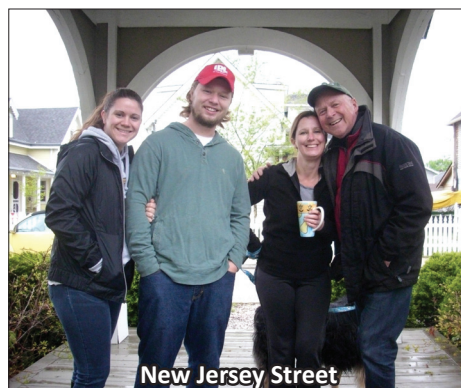
New Jersey Street