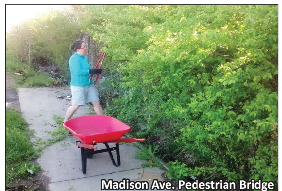
Madison Ave. Pedestrian Bridge