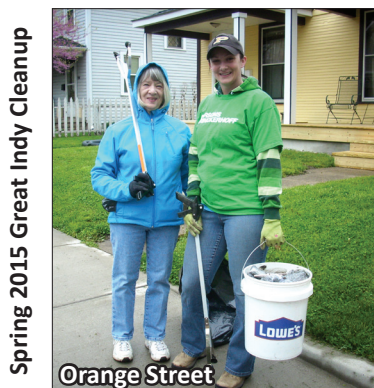
Spring 2015 Great Indy Cleanup