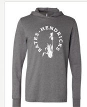
Hooded Long Sleeve $30 A lightweight long sleeve with a hood available in gray with white BH iris logo. Small to 2XL available.