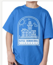
Kids T-Shirt $12 Show off your child's neighborhood pride. Available in bright blue with white BH house logo in XS to Large.