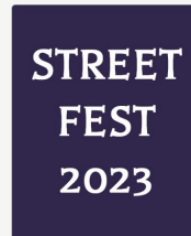
2023 Street Fest Pre-order Looking for shipping options? More colors? More sizes? More items? Check back in August 2023 for the Street Fest pre-order. Once a year, Bates-Hendricks hosts an online pre-order to support our annual event, Street Fest. This is the only time we are able to offer shipping if you are not local.