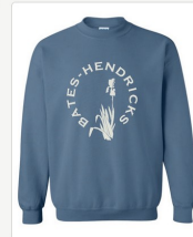
Crewneck Sweatshirt $30 Currently available in slate blue with white BH iris logo, unisex sizes small to 3XL.