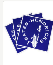
House Sign $15 Show your Bates-Hendricks pride with a house sign. These signs can be displayed inside or outside.