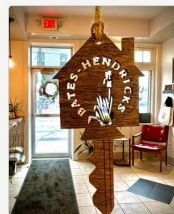
Wood Ornament $12 Decorate your holiday tree or display in your car. These wood laser-cut home keys are available with the BH iris logo.