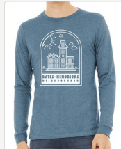
Unisex Long Sleeve $30 Currently available with limited sizing in maroon with white BH house logo and light blue with white BH house logo. Restocking during Street Fest pre-order in August 2023.