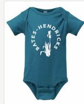
Baby Onesie $18 They're never too young to represent Bates-Hendricks! Available in sizes 6 month, 12 month, and 18 month in teal blue with white BH iris logo.