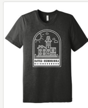
Unisex T-Shirt $12 Currently available in royal blue with white BH iris logo, sizes small to 2XL.

Hats, and crew necks, and tank tops, oh my! Lincoln Lane Coffee is freshly restocked with all new Bates-Hendricks gear to wear where you live. See all available Bates-Hendricks items available for purchase by visiting www.bateshendricks.org/merch .