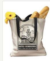
Tote Bag $18 Let us carry that for you... in a tote bag! These canvas bags come with black handles and a black BH house logo.