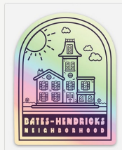
Holographic Sticker $3 Dress up your computer, water bottle... anything! with a holographic BH house sticker!