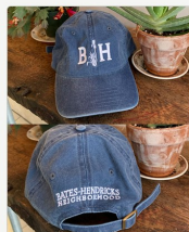
Baseball Cap $35 Currently available in green and charcoal with white embroidery. One size adjustable.