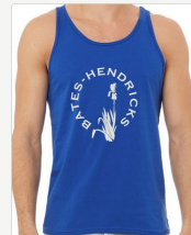
Unisex Tank Top $20 Limited stock available in navy with white BH iris logo. Restocking in April 2023 in royal blue with white BH iris logo.