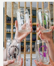
Ale Glass $8 Cheers with your neighbor in a BH iris logo ale glass. Limited colors remaining.